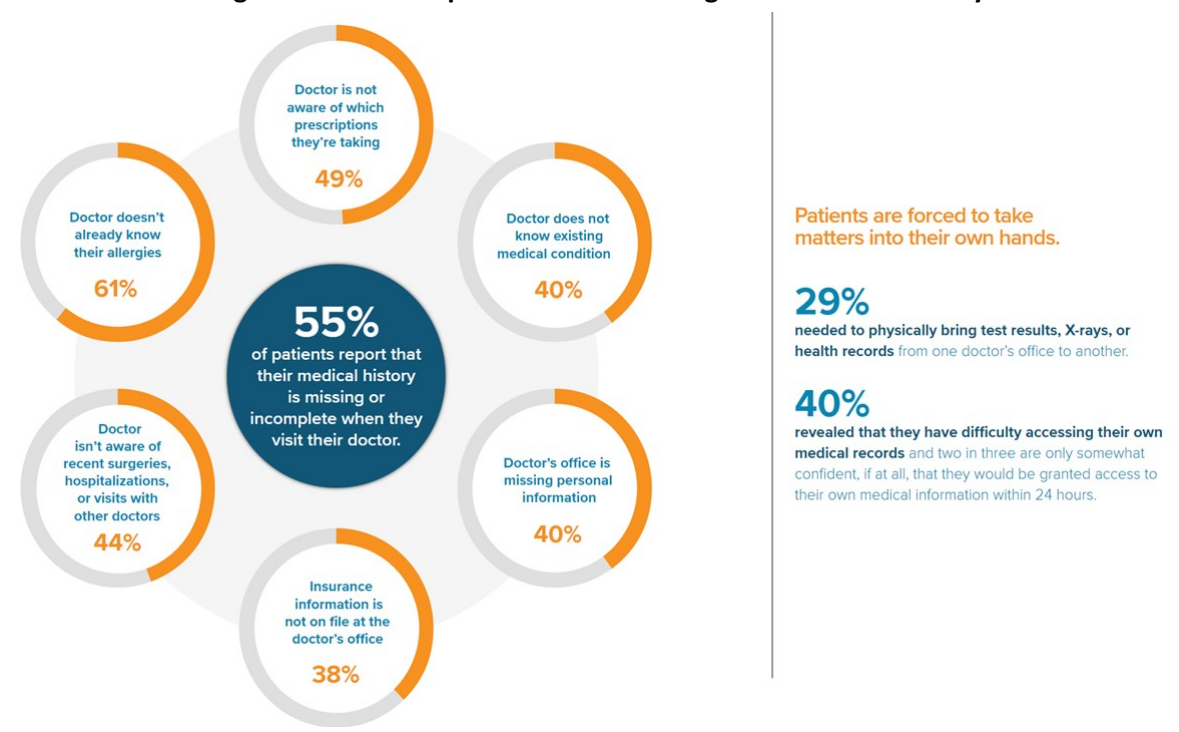
Figure 2: Patient Experiences in Accessing Their Medical History<sup>9</sup>

provide support for cross-border or cross-jurisdictional emergency and unplanned care. Practitioners need to join forces to make digital health happen: patient summaries could be a useful starting point.